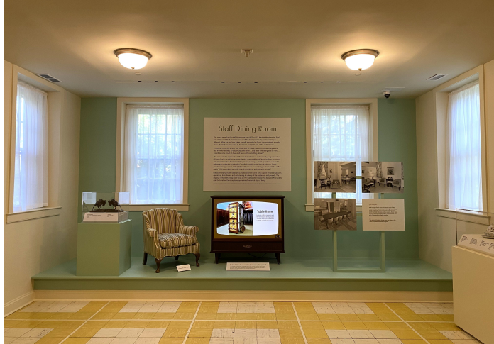
The television in the newly refreshed staff dining room allows visitors to get a sneak peek into behind-the-scenes spaces at Hillwood.

Click here to learn more about the revitalized space in this article by Jason Speck, head of archives and special collections.