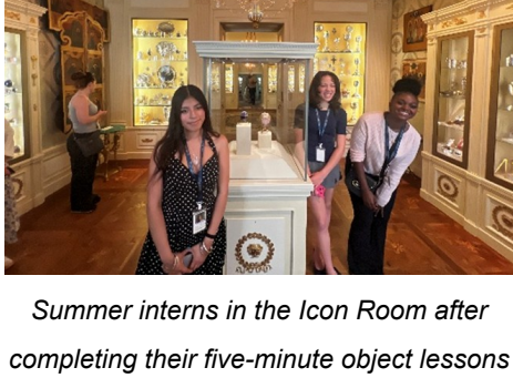
Summer interns in the Icon Room after completing their five-minute object lessons for visitors and staff in the mansion.