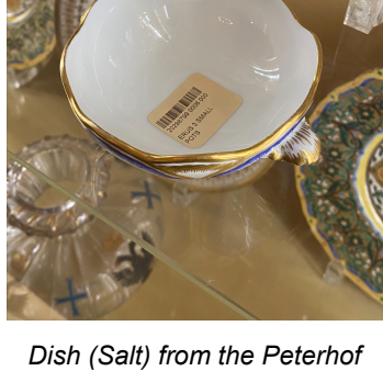
Dish (Salt) from the Peterhof Banquet Service Imperial Porcelain Factory, Russian, founded 1744, St. Petersburg, 1800s, Porcelain, gilt, IL2022.3.36

Labels, old or new, are very important parts of an object's history. They often bring significant information like the provenance, or previous ownership, of an artwork. On the image to the right, an auction sticker from the sale the piece came from can be seen on the interior of a salt dish in the Russian porcelain room. The curatorial team aims to keep labels intact, especially if they are not too visible and when the adhesive is not an issue for the piece or the material.