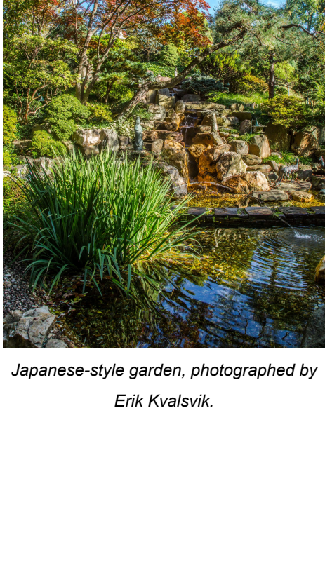
Japanese-style garden

Thank you for taking the time to share your thoughts with us. Together, we can continue to make Hillwood a place where both visitors and volunteers thrive.