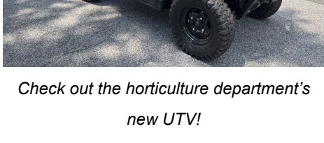
Check out the horticulture department's new UTV!

The horticulture department received an equipment upgrade this summer. Visitors will now see a Polaris Pro XD Kinetic UTV aiding the staff in the maintenance of the gardens. It is electric, getting 45 miles to the charge, and can tow 2,500 lbs, which is important for bringing compost up from the access road. The new vehicle will help to replace the dwindling fleet of 20+ year old diesel tractors that have seen a lot of hard use over their lifespan.