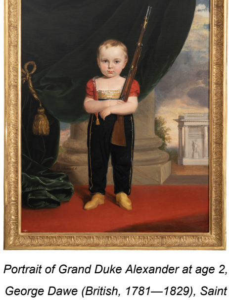
Portrait of Grand Duke Alexander at age 2, George Dawe (British, 1781–1829), Saint Petersburg, 1820, oil on canvas, Museum purchase, 2022 (2022.2.2)