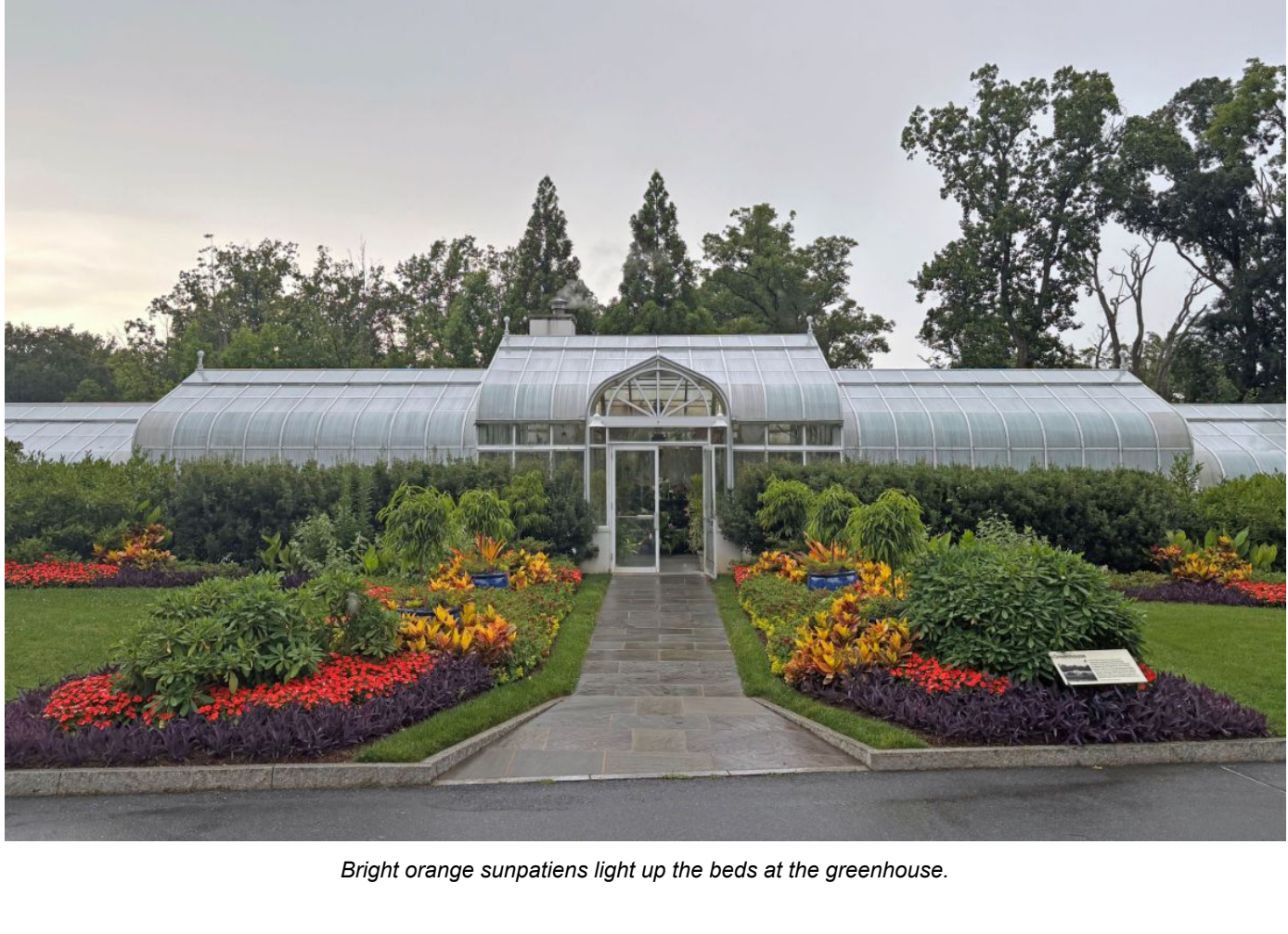
Bright orange sunpatiens light up the beds at the greenhouse.