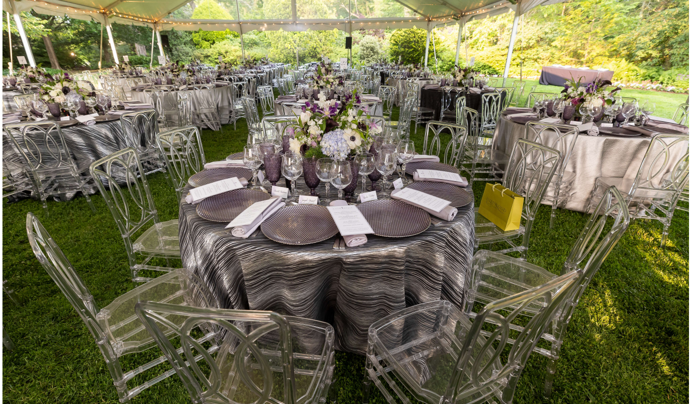
The tent and dinner setup for Hillwood's 2025 Gala Royale.