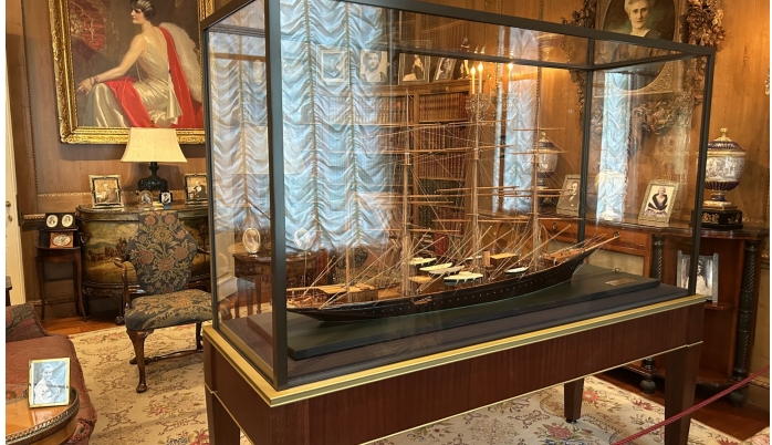
Sea Cloud model on view in the first-floor library.

We hope you enjoy this refreshed and enhanced display.