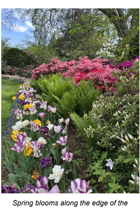
Spring blooms along the edge of the Lunar Lawn.

We look forward to welcoming back our garden docents for the upcoming fall touring season, which will run from Tuesday, September 2 to Sunday, November 16 . Tours will be offered at 10:30 a.m. and 12:30 p.m. Tuesday-Sunday, with an additional 2:30 p.m. tour Friday-Sunday. For more information, please visit the 2025 Garden Touring Season Information page on the volunteer website.