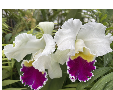
Cattleya blooming in the greenhouse display.

Orchid month is here! The entrance house display has a great variety of flowers on view. The display is representative of some of the major orchid groups in the collection. Click here to go a little deeper on the flowers that you will see on your next visit to the greenhouse in this article by Jessica Bonilla, director of horticulture.