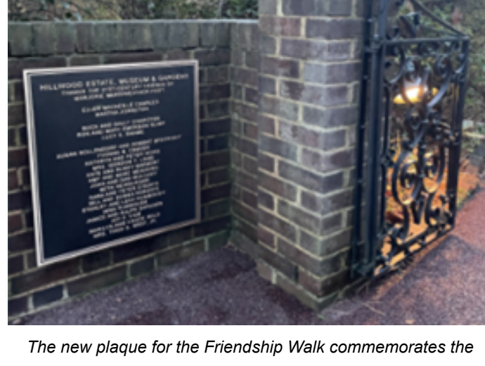
The new plaque for the Friendship Walk commemorates the generous donors who supported Hillwood's recent porous pathways project.

A new plaque was installed for the Friendship Walk to commemorate the generosity of those who supported the recent porous pathways project . Recognized as the "21st-Century Friends of Marjorie Merriweather Post," they joined us for a celebratory unveiling on December 9, 2024.