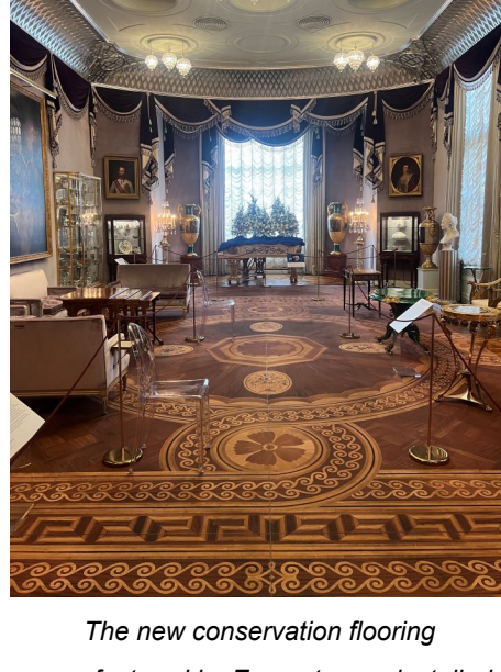
The new conservation flooring manufactured by Eyemats was installed on November 18.