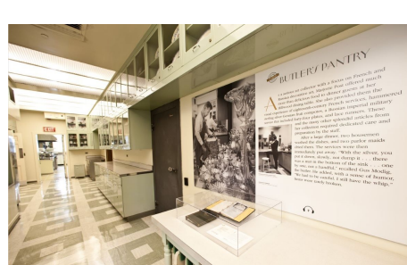
The pantry, pictured here, and staff dining room will be refreshed with new objects and interpretation in 2025.