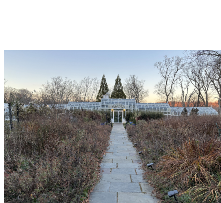
Winter is coming.