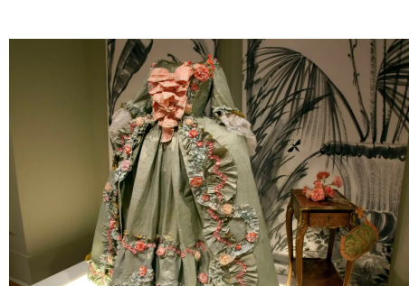
Isabelle de Borchgrave's gorgeous paper sculptures were on display in the 2012 special exhibition Prêt-à-Papier.

We are honored to have a few pieces by de Borchgrave in Hillwood's collection, which are often displayed in the pavilion. Visit the Prêt-à-Papier page on Hillwood's website to learn more about de Borchgrave's work and the exhibition.