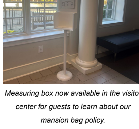
Measuring box now available in the visitor center for guests to learn about our mansion bag policy.

Hillwood has introduced two updated visual resources to aid in a more streamlined implementation of our bag policy: updated measuring boxes and ribbons for exempt items. Two new measuring boxes are now available in the coat room and visitor center. Each measure about 11x14x8 inches, and the open top is designed to allow guests to easily check if they can keep their bag or item with them as they explore the mansion. The ribbons for exempt items will help volunteers and staff identify individuals who have been granted a bag policy exception and received prior guidance about our bag policy. For more information about these visual resources and Hillwood's bag policy, please consult the Updated Visual Aids for Hillwood's Bag Check Policy document.