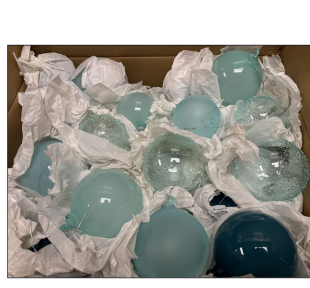
Holiday décor coming soon to Hillwood.