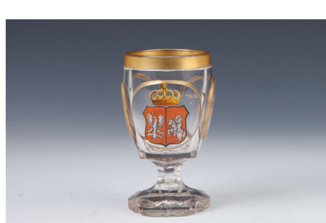
Goblet, Poland, 1830—31, glass (23.231).