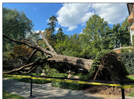
American elm outside of the French parterre.