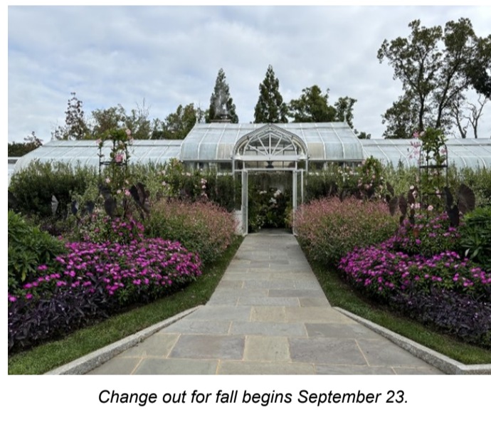
Change out for fall begins September 23.