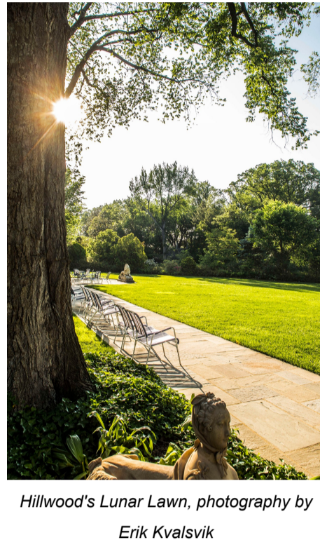
Hillwood's Lunar Lawn

We are also piloting a third garden tour this fall. In September, Hillwood is offering garden tours at 1:30 p.m., Friday through Sunday. In October and November, we will offer garden tours at 2:30 p.m., Friday through Sunday. For more information, please visit the 2024 Garden Touring Season Information page on the volunteer website.