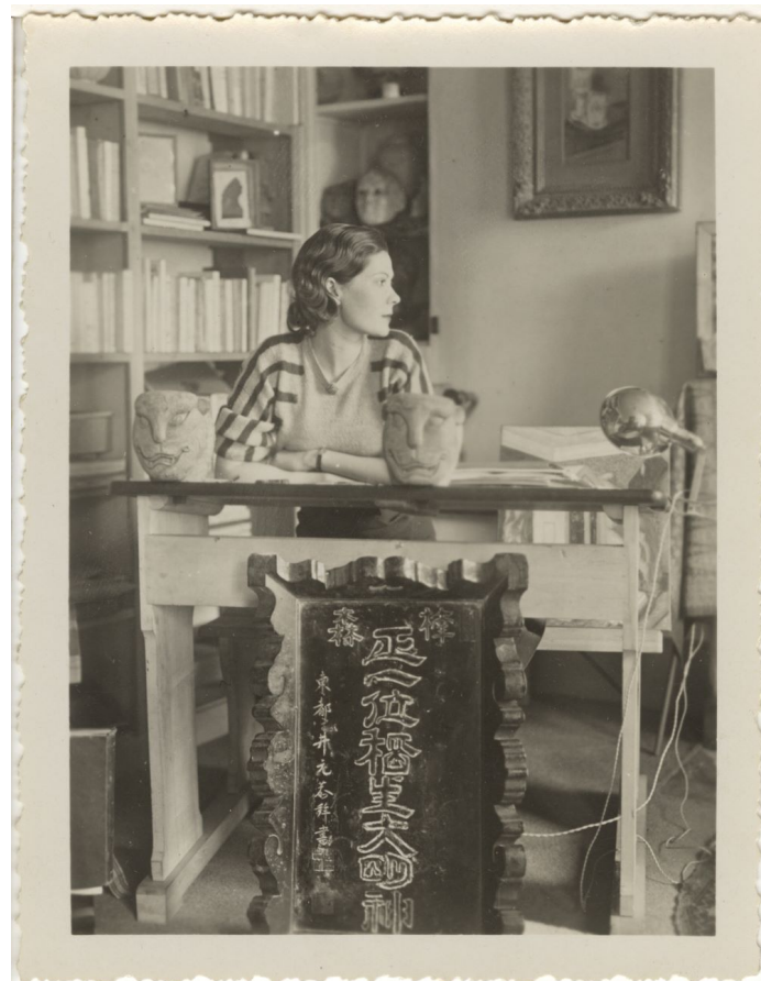
Photograph of Princess Natalie Paley in Jean Cocteau's apartment, Paris, 1931-32.