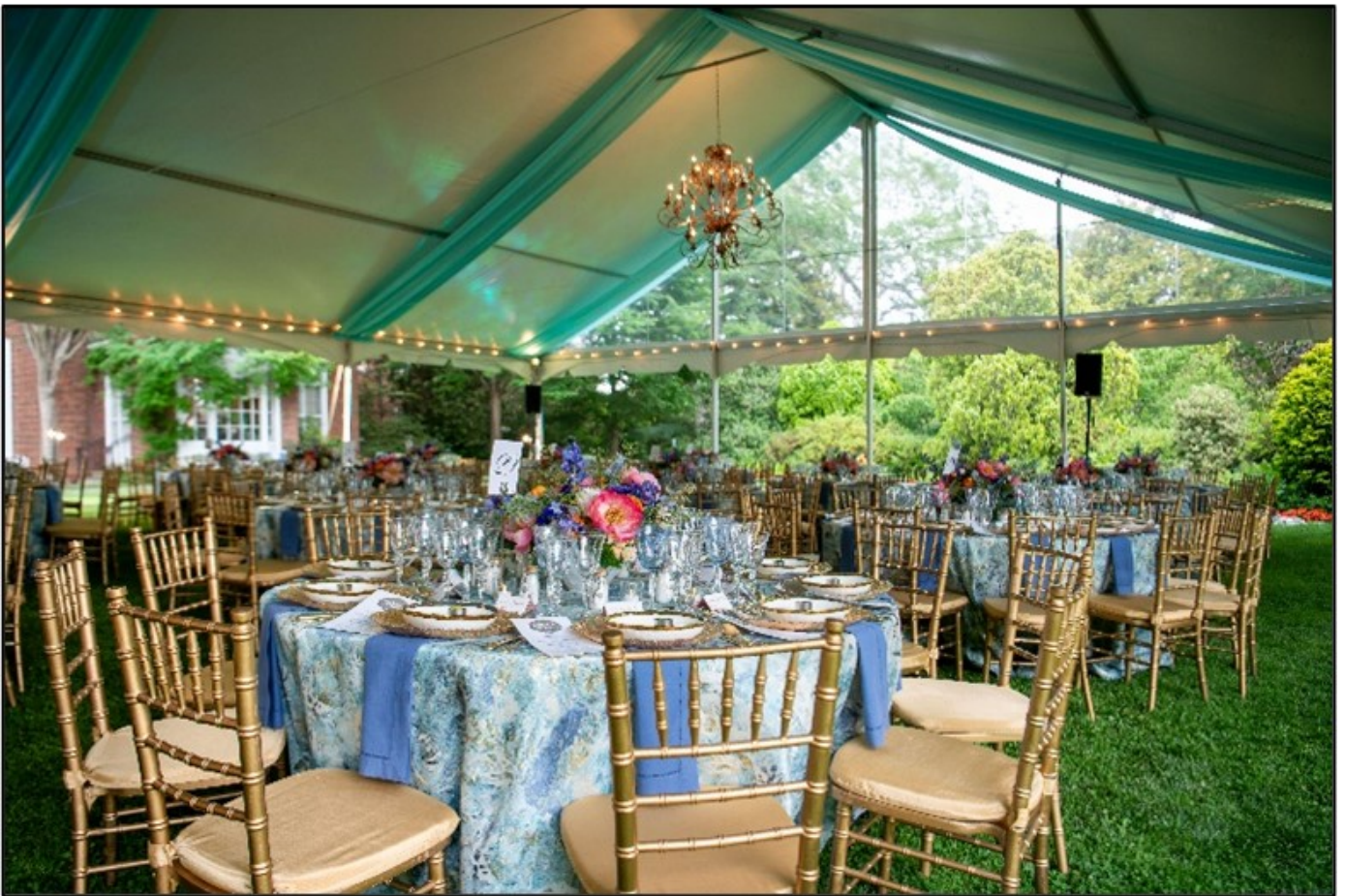
Tent and dinner set up in the Lunar Lawn for this year's gala.