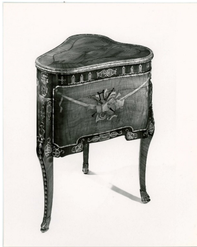
Heart-shaped table, French and Company, interior designer (American, 1907–present), France, ca. 1928, wood, mother-of-pearl, gilt bronze. Bequest of Marjorie Merriweather Post, (31.110.1)