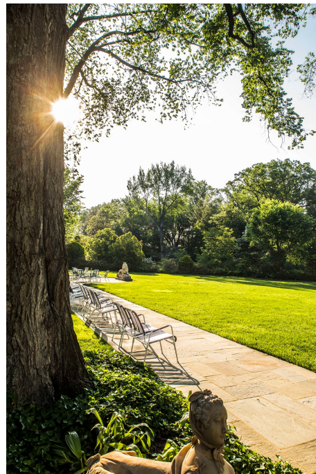
Hillwood's Lunar Lawn

We are eagerly looking forward to the return of our garden docents in the upcoming fall season. The fall docent-led garden tours will be available from Tuesday, September 3 through Sunday, November 10. Tours will be offered at 10:30 a.m. and 12:30 p.m., Tuesday-Sunday. For more information, please visit the 2024 Garden Touring Season Information page on the volunteer website.