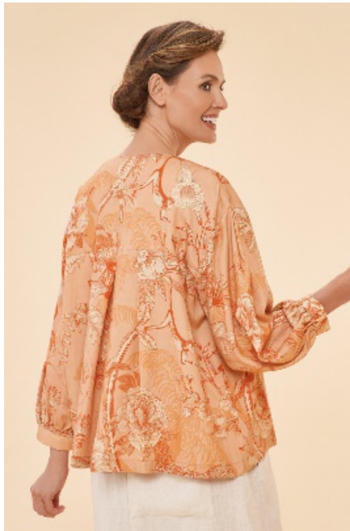
Museum shop's new toile print puff sleeve jacket.