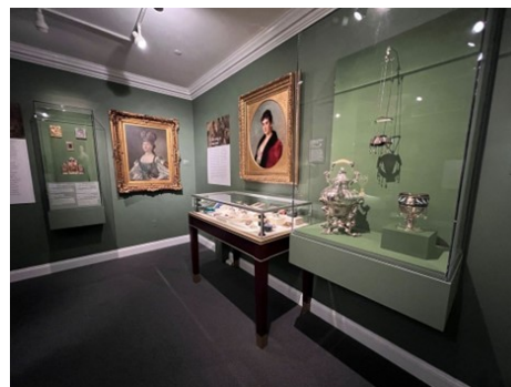
The Second Floor Gallery is now open to the public.

After the recent closure of the Russian Sacred Arts Gallery, Hillwood refreshed the second floor gallery space. The gallery features new displays and a new storyline inspired by Hillwood's new publication, The Houses and Collections of Marjorie Merriweather Post: The Joy of It . Now open to the public, Second Floor Gallery: Understanding Post's Legacy explores the history of Hillwood's collection amassed by founder Marjorie Post and developed by the museum since its opening to the public on July 11, 1977. Please see the volunteer website for educational resources related to the refreshed gallery on the Second Floor Gallery: Understanding Post's Legacy Information page.