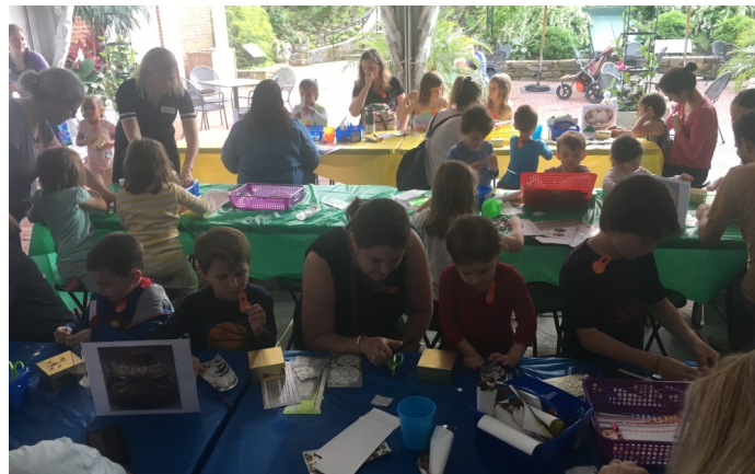
Art activity at Pajama Party Movie Night

We are excited to announce that Hillwood is recruiting a new class of Family Art Volunteers from our existing volunteer corps. This presents a unique opportunity for active volunteers who are interested in expanding their service with Hillwood. Family Art Volunteers play a key role in facilitating art-making activities for families and adults at our public programs. Family Art Volunteers commit to serving four, four-hour shifts during art workshops that are part of festivals and other family-friendly public programs. These shifts typically occur about 10 days per year, primarily on Fridays, Saturdays, and Sundays.