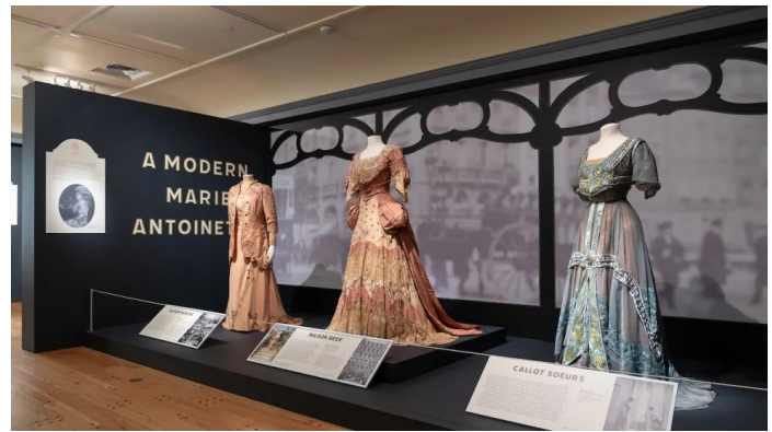
French couture gowns on display in Marjorie Merriweather Post's Paris