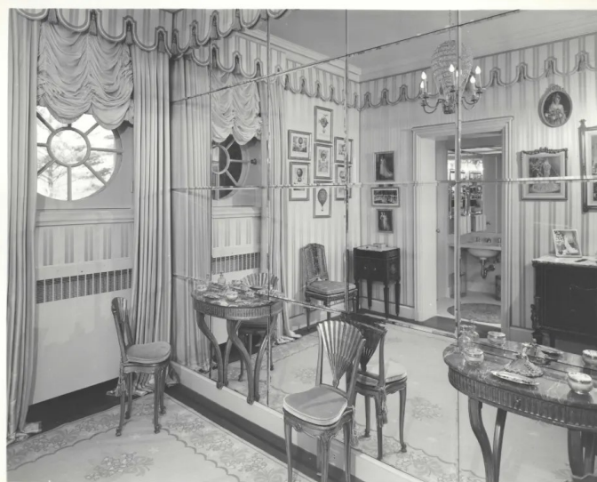
Archival photo of the powder room, located on the first floor of the mansion

The powder room on the first floor of the mansion was recently reinstalled to approximate how it was during Marjorie Post's time with more accuracy. The original rug was reinstalled, as well as a recently restored table by the significant 19th-century Parisian ébéniste François Linke (Bohemian, 1855-1946) in the style of Jean-Henri Riesener. On top of this table is a rococo-style mirror and a pair of 20th-century vases from the Imperial Glass Factory in St. Petersburg. A second 19th-century Louis XVI-style table was moved and installed with a pair of 20th-century French glass vases and pieces from a Gorham silver toilette service from ca. 1920. Please read this document for more information on the objects installed in the powder room.