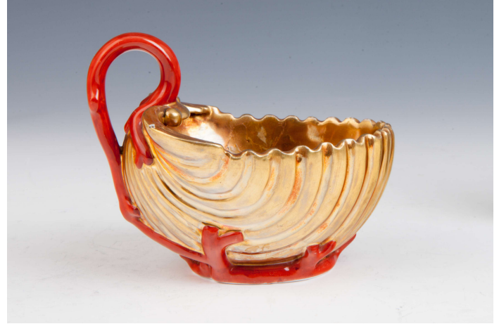
Fragile Beauty: Art of the Ocean will open in the Adirondack building on Saturday, June 8, 2024

To aid volunteers in promoting Hillwood, please reference our new document 2024-2027 Exhibition Calendar for an overview of upcoming exhibitions, descriptions, and display dates. This offers a sneak peek into what Hillwood has planned for the next couple of years. Current and upcoming exhibitions are posted on Hillwood's website about one year in advance. We hope you are as excited as we are for Hillwood's upcoming shows.