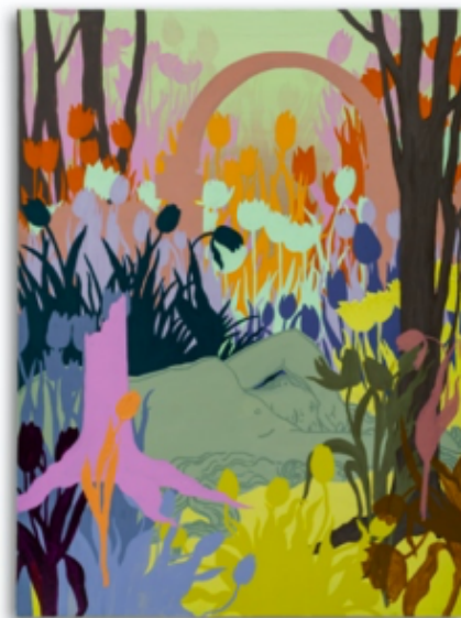
MK Bailey, Tulip Fever Dream, 2023

Following her time at Hillwood, MK created several artworks that will be featured in her new exhibition, BUCOLIA . This exhibition, "an immersive examination of The Garden as a site of both immense beauty and tragedy" will be on view at Transformer from February 3-March 16, 2024.