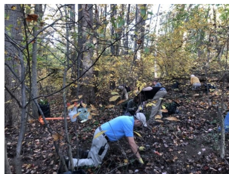
Outdoor woodland stewardship volunteers removing invasive ivy

The last day for outdoor garden support volunteers and cutting garden volunteers this season was Friday, December 8. Thank you to all outdoor volunteers for another successful season outside in the gardens. We couldn't do it without you! Enjoy your winter's rest and we look forward to seeing you back in the gardens next spring!