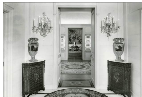
View of foyer (with carpet also!) looking into the Russian porcelain room and featuring 42.5, the first carpet acquired by Post for this space, 1960.