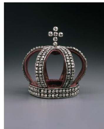
Nupital crown (17.63)