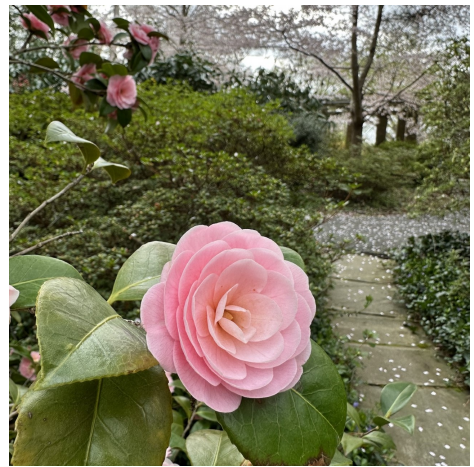
Camellia near the formal rose garden