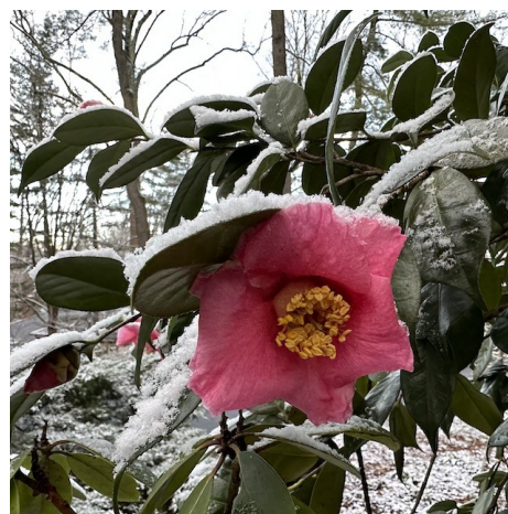
Camellia blossom near Friendship Walk