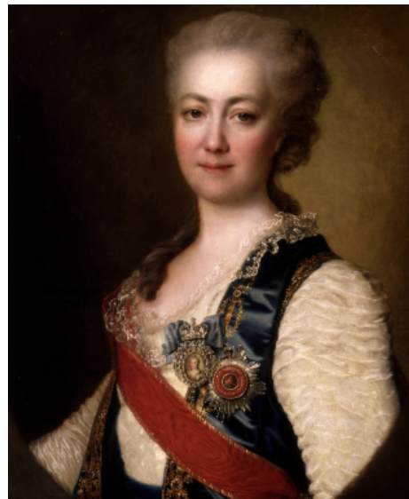
Portrait of Princess Dashkova (51.66)