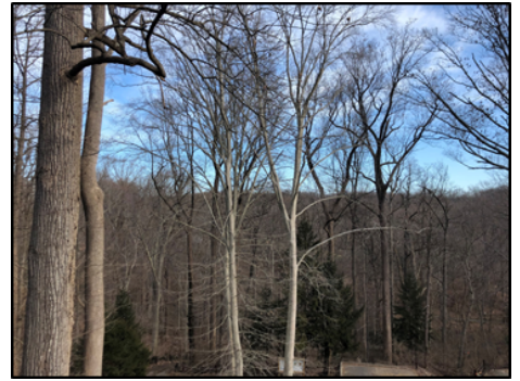
Winter trees around Hillwood

Trees are an important part of our environment and of Hillwood's landscape that require attention while Hillwood is closed to the public. Learn more here about what happened behind the scenes this winter and about two of our important residents.