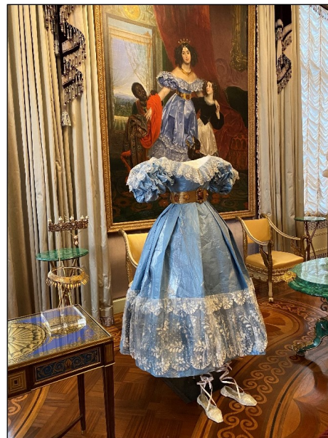
Special display in the pavilion

Click here to see some of the new installations in the mansion.