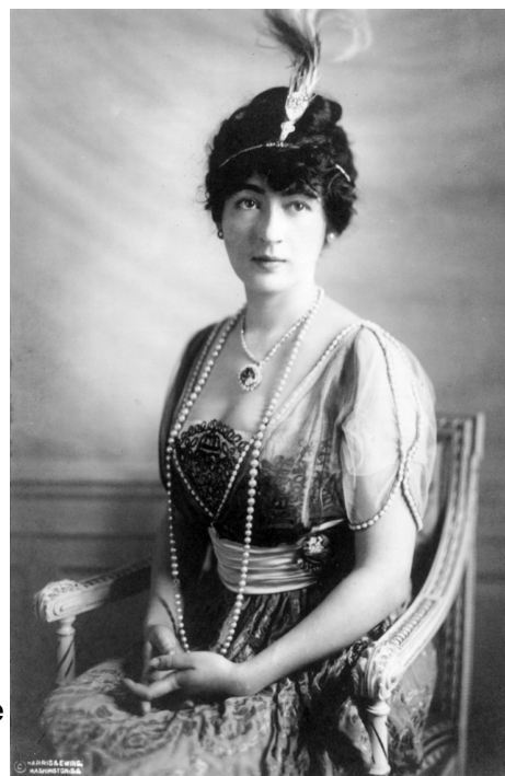
Evalyn Walsh McLean, 1914

To submit a question for a future newsletter, click here . To learn more about the new Collections and Research Center, visit Hillwood's website .