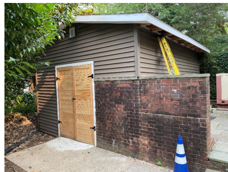
Exterior view of the new programming storage.

Over the last few summers, we have increased our outdoor programming with more concerts and dance performances than in years prior. Since the Lunar Lawn doesn't have a permanent stage, we looked for creative locations to store the large interlocking stage panels that must be set up and broken down for each run of performances that wouldn't affect the serenity of the gardens around Hillwood. Tucked in near the side entrance of the mansion near the Security control room, we found just the spot. Close to the Lunar Lawn but out of sight, this shed is just large enough to fit the 16 stage panels each weighing about 150 lbs., the cart to move them, and the outdoor chairs that all go into each show. The facilities team got their first real world test of the new location for the Coyaba dance performances a few weeks ago in late July and it cut the set up and breakdown time in half compared to the original storage location in the C.W. Post Garages.