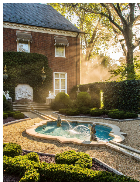
Photo of Hillwood's French parterre

To apply, interested candidates should review the detailed position description and complete the online application on Hillwood's website. Completed applications must be received by Sunday, September 3.