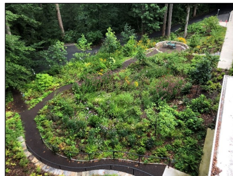
Collections & Research Center native garden from the overlook.

Click here to learn more about the summer flowers in Hillwood's native garden.