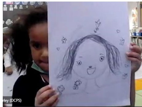
A student shares a self-portrait drawn during the "Powerful Portraits" virtual field trip.

Read the full article here to learn more about Hillwood's innovative approach to virtual school programming, as well as the return of onsite school field trips, and what is in store for the upcoming school year.