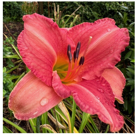
Daylily 'Cedar Waxwing' at the visitor center.