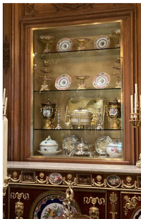
Updated display case in the mansion dining room.

Click here for the object information and locations on the new displays in the mansion.