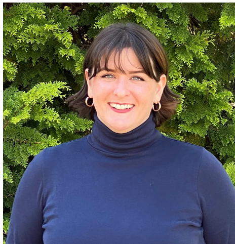
New Collections & Curatorial Administrator