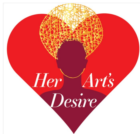
Her Art's Desire logo.

To learn more about Her Art's Desire , click here .