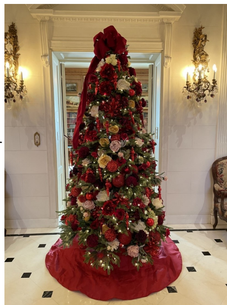
Entry hall tree.

Click here to read more about this year's holiday display, Haute Holidays .