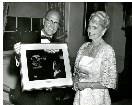
Marjorie Post receiving a plaque from the NSO in honor of her 80th birthday.

To submit a question for a future newsletter, click here . To learn more about the new Collections and Research Center, visit Hillwood's website .