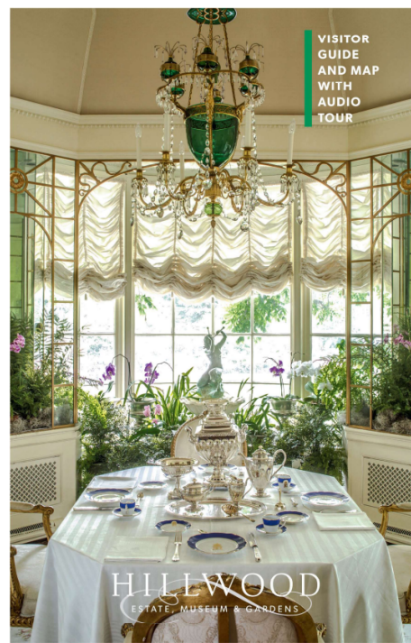
New digital visitor guide now available via QR codes in the visitor center and Hillwood's website.

Feel free to share the link with friends and family to spread the word about Hillwood.