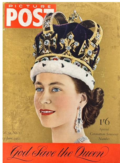
Souvenir magazine from the coronation of Elizabeth II

To submit a question for a feature newsletter, click here . To learn more about the new Collection and Research Center, visit Hillwood's website .