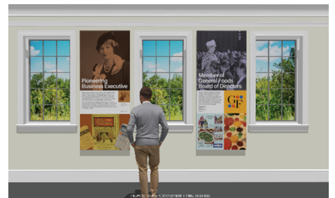
2022 Visitor Center display