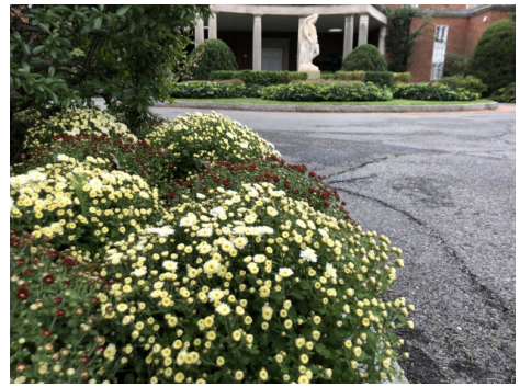
Chrysanthemums blooming in the motor court.

Click here to learn more about the new displays in the gardens.