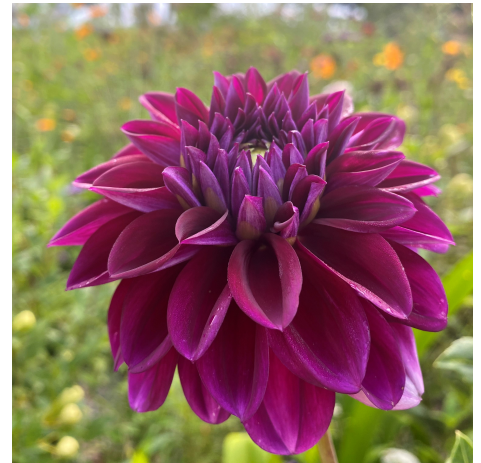
It's dahlia season in the cutting garden.