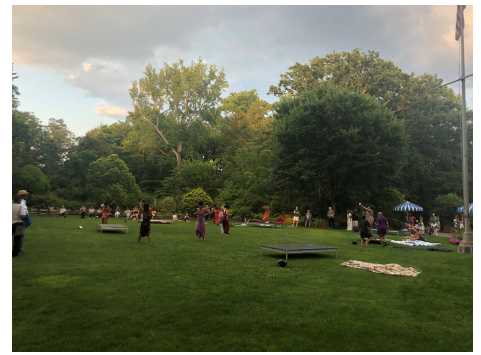
One of many programs held on the Lunar Lawn.

Click here for more details about Hillwood's lawn care and the putting green.