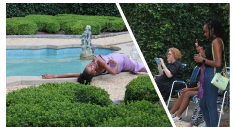
The audience was captivated by elements of Yes, And performed in the French Parterre, July 14-16, 2022.

Building on the tremendous success of last summer's partnerships with local dance organizations, Hillwood's gardens again sprang to life in July and August thanks to partnerships with local dance organizations. Nearly 800 visitors enjoyed summer evenings in the garden and one (or more!) of three dance productions. Read on to learn about performances presented with Dance Place, SOLE Defined, and the Dance Institute of Washington.