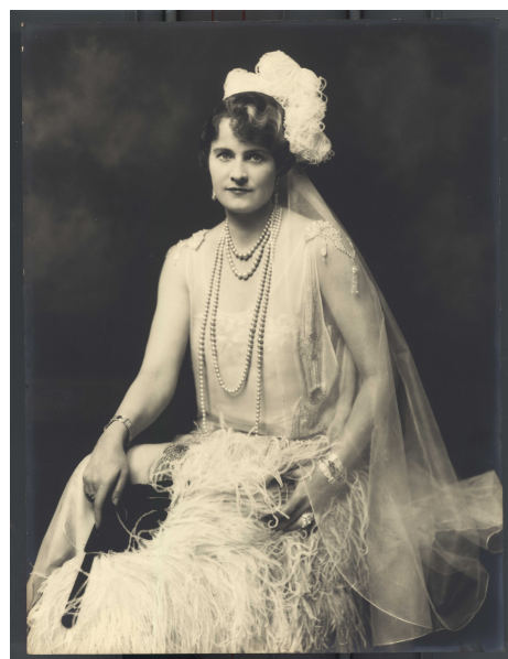
Marjorie Post photographed in her presentation gown. This photo is located in the snooze room on the second floor of the mansion.

To submit a question for a feature newsletter, click here . To learn more about the new Collection and Research Center, visit Hillwood's website .