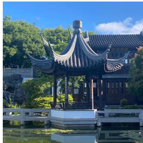
The Moonlocking Pavillion at the Lan Su Chinese Garden.

Click here to read more about Drew's week in Portland.