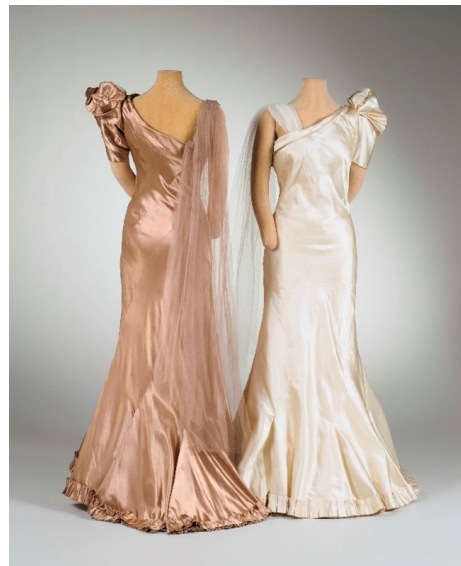
Evening gowns, Robert Piguet (Swiss, 1898–1951), Paris, about 1937, Silk satin, tulle Bequest of Marjorie Merriweather Post, 1973 (48.76, .77)

Among the hundreds of apparel and accessory objects in Hillwood's collection are two very special, twentieth century haute couture gowns connecting our founder, Marjorie Merriweather Post (1887-1973), to the atelier of Swiss-born couturier Robert Piguet (1898-1951). Piguet's fashion house was the epicenter for young designers starting out, who would later become legends of their craft. Marjorie Post often ordered favorite styles in varied colorways. While abroad during the late 1930s, she must have visited Piguet's shop. There, she chose these two evening gowns on display in her closets in the mansion during Hillwood's current special exhibition, Grace of Monaco: Princess of Dior through January 8, 2023.