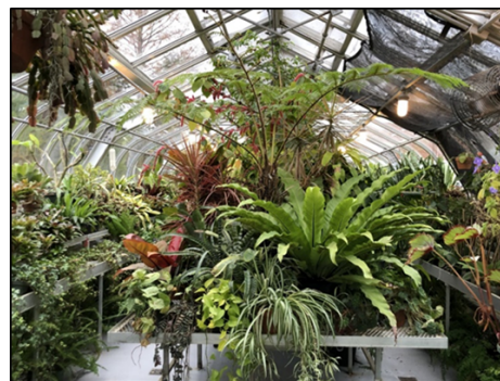
The tropical house packed with plants for the winter.

Learn more here about the summer seasonal display and a few of these interesting plants.