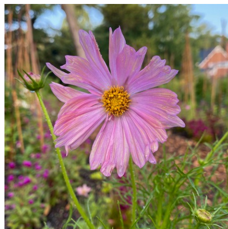
Cosmos 'Apricotta' in the cutting garden.