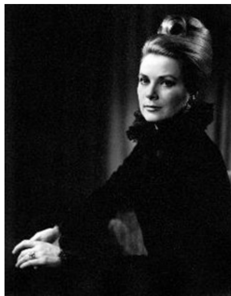
Princess Grace of Monaco in 1970 wearing one of Marc Bohan's designs for Christian Dior featured in Grace of Monaco: Princess in Dior.

Click here to learn more about this stunning exhibition and the work behind the scenes to bring this show from France to Hillwood.