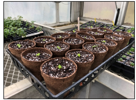
Biodegradable pots in the greenhouse

Looking to round out your Earth Day itinerary? Think about bringing family and friends to Hillwood. Visitors are invited to meet members of Hillwood's Environmental Action Team as well as outside organizations like Rock Creek Conservancy, Capital Nature, DOEE, and the DCSEU for great conversations on the Lunar Lawn. There will also be a children's activity, an arts and crafts supply exchange, a native plant give-away, and tours of Hillwood's new native garden. Click here to learn more Hillwood's Earth Day Celebration.