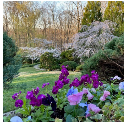
Flowering stock and pansies add to the spring excitement at the vista overlook.