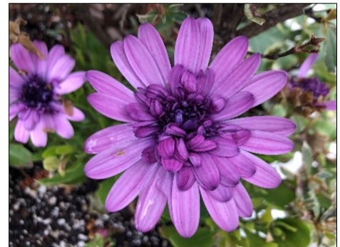
Osteospermum '4D Pink'

Click here to learn more about the 2022 spring garden.