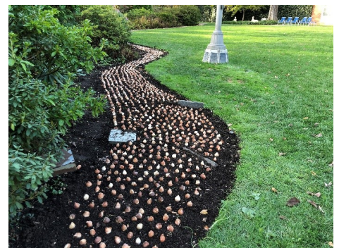
Layout in the Lunar Lawn beds

Click here to learn more about Hillwood's bulbs and installation process along with helpful tips for your own garden.