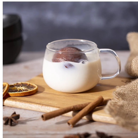
This Christmas cracker set, by Two's Company, includes three hot chocolate bombes.

Click here to view the latest staff picks and upcoming events for the museum shop.