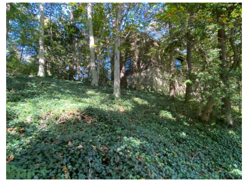
View of hillside behind the Adirondack building smothered in English ivy

Click here to learn more about this exciting volunteer opportunity.