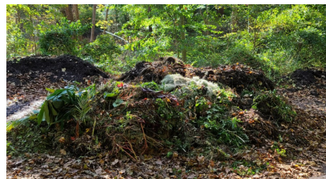
Main compost generaton area at the souther end of the property

Learn more about how you can make an impact by conserving water, recycling coffee grounds, switching to renewable technologies, and leaving the leaves while gardening this fall.