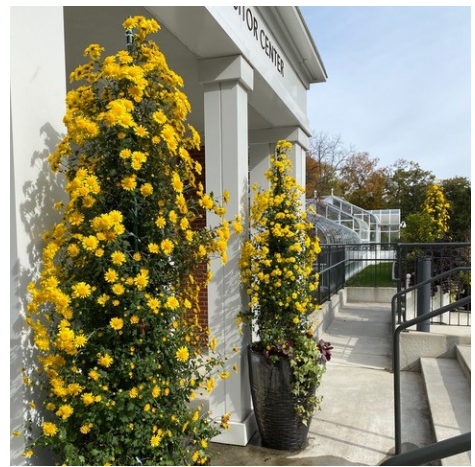
Chrysanthemum 'Megumi' trained as 5' topiaries at the visitor center