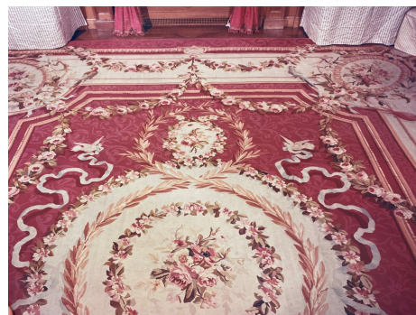
Hillwood's Rug in the Dining Room (detail) (acc. no. 42.1)

The 18 th century style rug on view in the mansion dining room draws your attention both for its size, measuring in at 489 x 240 inches, and striking design of rose red and cream color scheme adorned with intricate décor of flower bouquets as well as garlands and swags of roses, ribbons, clusters of musical instruments, parrots and other birds. Selected by Marjorie Merriweather Post in 1956, the rug matches the 18 th century French inspired style of the room. Although the history of Hillwood's rug can't be traced to its original owner, the curatorial team have identified the manufacturer.