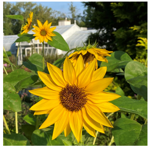
Sunflowers in the cutting garden.