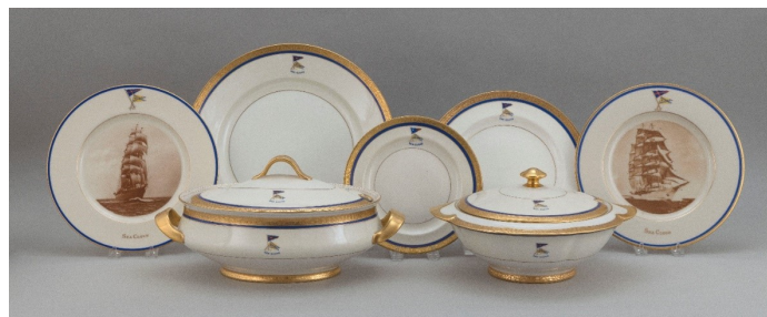
Pieces from the Sea Cloud Service, including covered tureen, three plates, oval vegetable dish with handles (Haviland & Company, Limoges), and a pair of plates with transferware printing (Lenox, Inc.), French and American, mid-20th century, hard-paste porcelain. Museum Purchase, 2021 (2021.2.1-7)

Click here to learn more about this new additions and how they help support and strengthen Hillwood's collection.