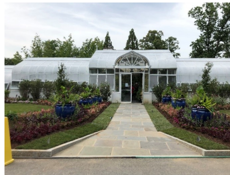
A stately new entrance to the greenhouse

To see photos and learn more about how this garden physically came to be, click here .