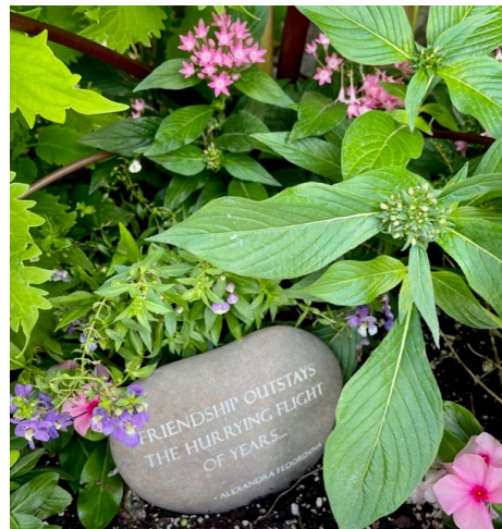
New Garden Stones made exclusively for Hillwood

The museum shop expanded their store hours, and are now open Tuesday through Sunday from 10 a.m.-5 p.m. To shop online, visit https://store.hillwoodmuseum.org/discount/Volunteer21 and use your discount code of Volunteer21.