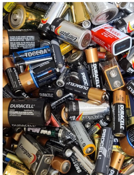
Quarterly battery collection

Read more about Hillwood's recycling program and how you can share your ideas to help support our sustainable business model.