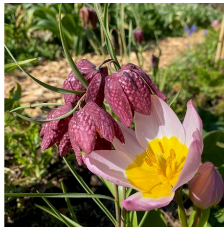
Tulipa bakeri 'Lilac Wonder' with Fritillaria meleagris in the cutting garden