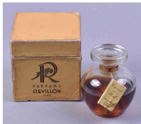
Carnet de Bal Perfume and Box, Revillon Frères (French, 1732-1982), Paris, about 1940, glass, paperboard, Museum Purchase, 2018 (2018.4-4a)

Click here to learn more about Marjorie Post's beauty rituals and personal care.