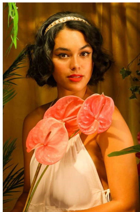
New headbands by Scottish Vendor Powder Design UK are now available in the museum shop

To shop in person, please remember to book your reservation in advance by selecting a date and time to visit the estate. To shop online, visit https://store.hillwoodmuseum.org/discount/Volunteer21 and use your discount code of Volunteer21.