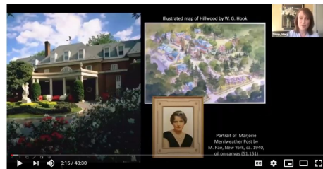
Eight virtual mansion tours are now available on Hillwood's new digital library

Led by seasoned volunteer docents, the tour recordings feature room views, collection highlights, and archival images. Visitors can select from eight virtual tours based on the docent's tour theme. As a result of months of hard work from our dedicated pilot docent team and IT staff, this innovative new resource allows Hillwood to share these fabulous tours with a broader audience during the pandemic and beyond.