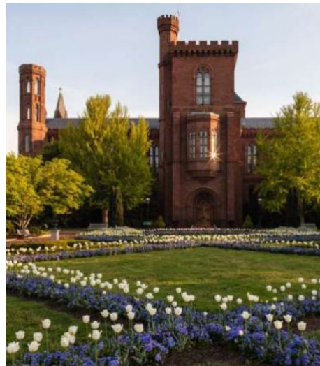
Smithsonian Gardens are featured, along side Hillwood, in the new publication by Horticultural Consortium of the Greater Washington Area

While we are unable to make any formal plans at the moment for the next consortium meeting, we hope a few pictures of the local gardens will help spread some cheer!