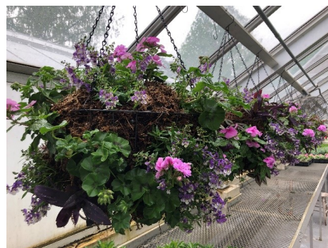
Summer baskets for the Merriweather café

Click here for more information on this exciting time in the gardens.