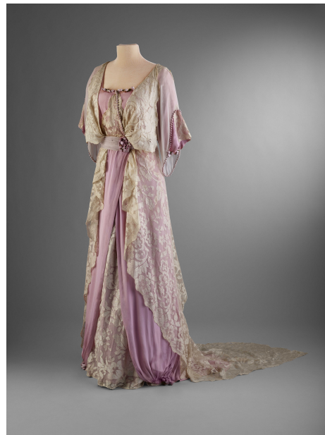
Evening dress, New York, about 1913, Silk satin, chiffon, machine-made cotton lace, silk and wax flowers, Bequest of Marjorie Merriweather Post, 1973 (48.31)

To learn more about the gowns and their design inspirations, read the full article here .