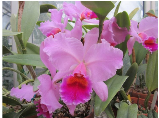
Orchids featured in the Greenhouse

additional greenhouses built adjacent to the existing one to cultivate this passion.