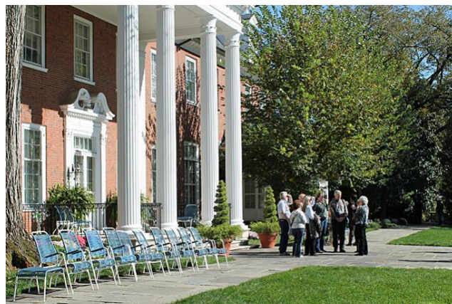
A group touring the gardens

expanding attendance by growing core audiences and reaching out to new audiences. Thank you to all volunteers who helped us achieve these goals, either by encouraging a group to visit Hillwood or by extending a warm welcome and gracious tour during their visit.