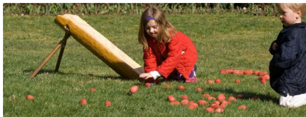
The Lunar Lawn is the site of the egg rolling game during the Fabergé Egg Family Festival