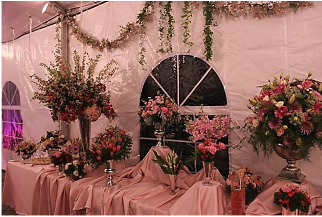
Floral arrangements created by Horticulture staff and volunteers