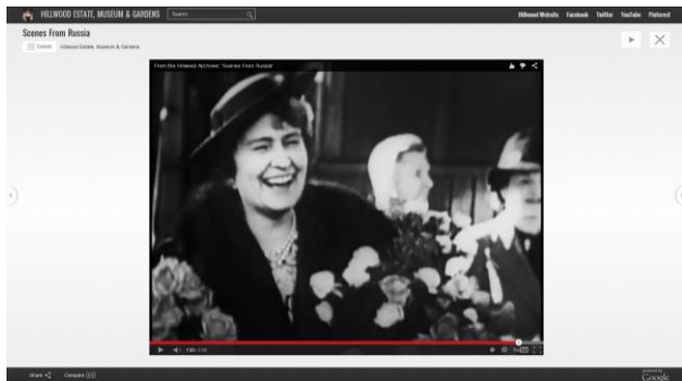
A computer screen shot of the travel videos now available on the online web exhibition

The films can also be found on the Hillwood Estate, Museum & Gardens official YouTube channel [https://www.youtube.com/user/HillwoodMuseum], where we hope to upload additional films over the coming months.