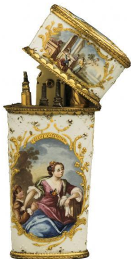
Étui featured in the exhibition

Hillwood's new exhibition Splendor & Surprise is now open to the public in the Dacha. The exhibition features more than 80 remarkable boxes, coffers, chests, and other containers that reveal the beautiful and unexpected ways cultures have contained their most treasured items and everyday objects