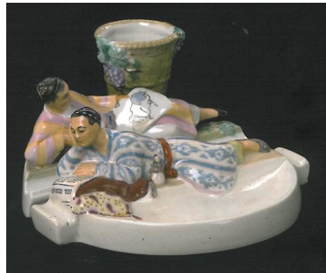
Ashtray from the Discussion of the Stalin Constitution in Uzbekistan desk set

Hillwood has acquired two new objects for the Russian collection: a pencil holder, ashtray, and tray from the Discussion of the Stalin Constitution in Uzbekistan desk set and a suite of jewelry by Ivan D. Tshitshelev. These new acquisitions are currently on display in the Pavilion. For the object label text , visit the “Mansion Rotation & Exhibition Information” page on the volunteer website under the “Education” tab.