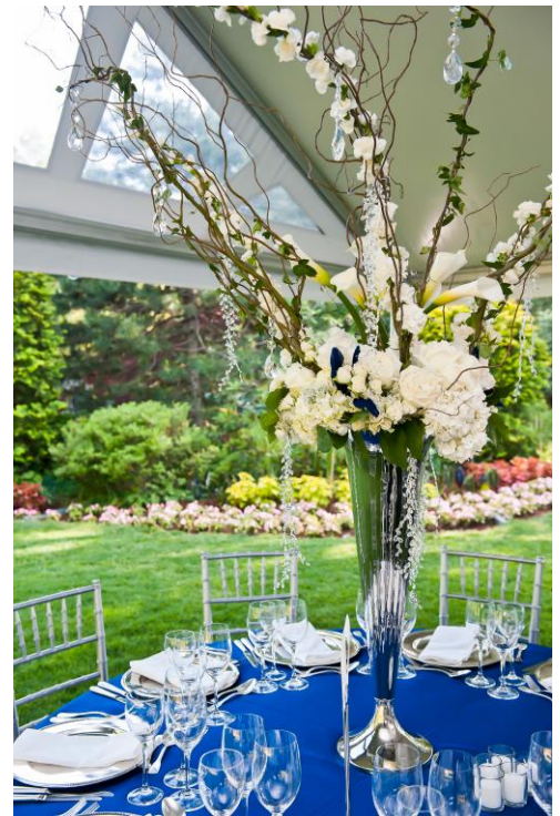
The table centerpiece is a great example of Hillwood volunteers' handiwork