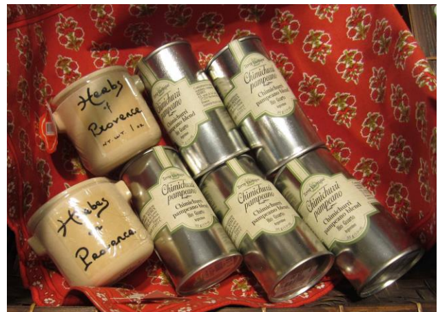
French grilling spice blends