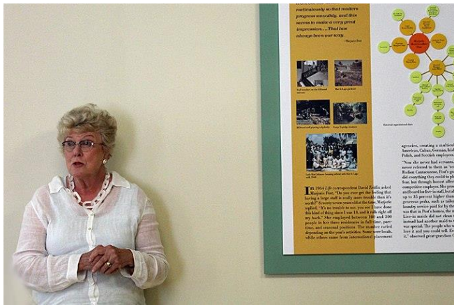
Hillwood Board President on-station in the newly redesigned Staff Dining Room during the Member Preview Days in early August