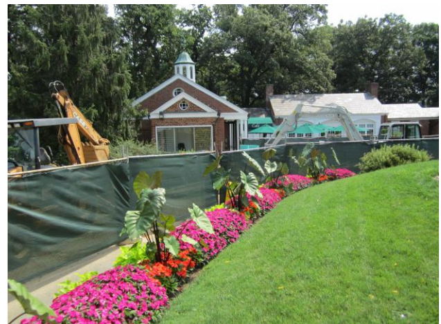
View of the Café from the Cutting Garden wall

Construction on the CW Post Courtyard project has begun. The Café is open though some pathways near the Café are closed during various phases of construction. Additional signage will be in place to help visitors navigate their way to the Café, in addition to maps available in the Visitor Center.